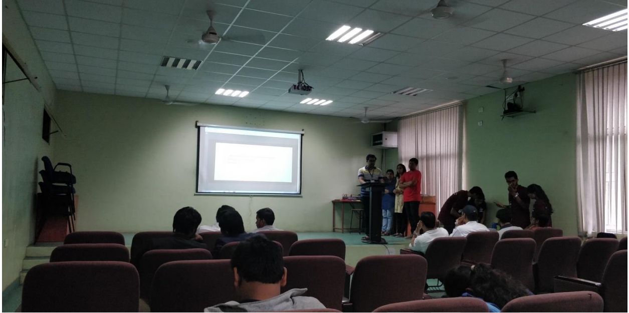
(In picture: Above- Beta-Pitch, Below- Eloquence)