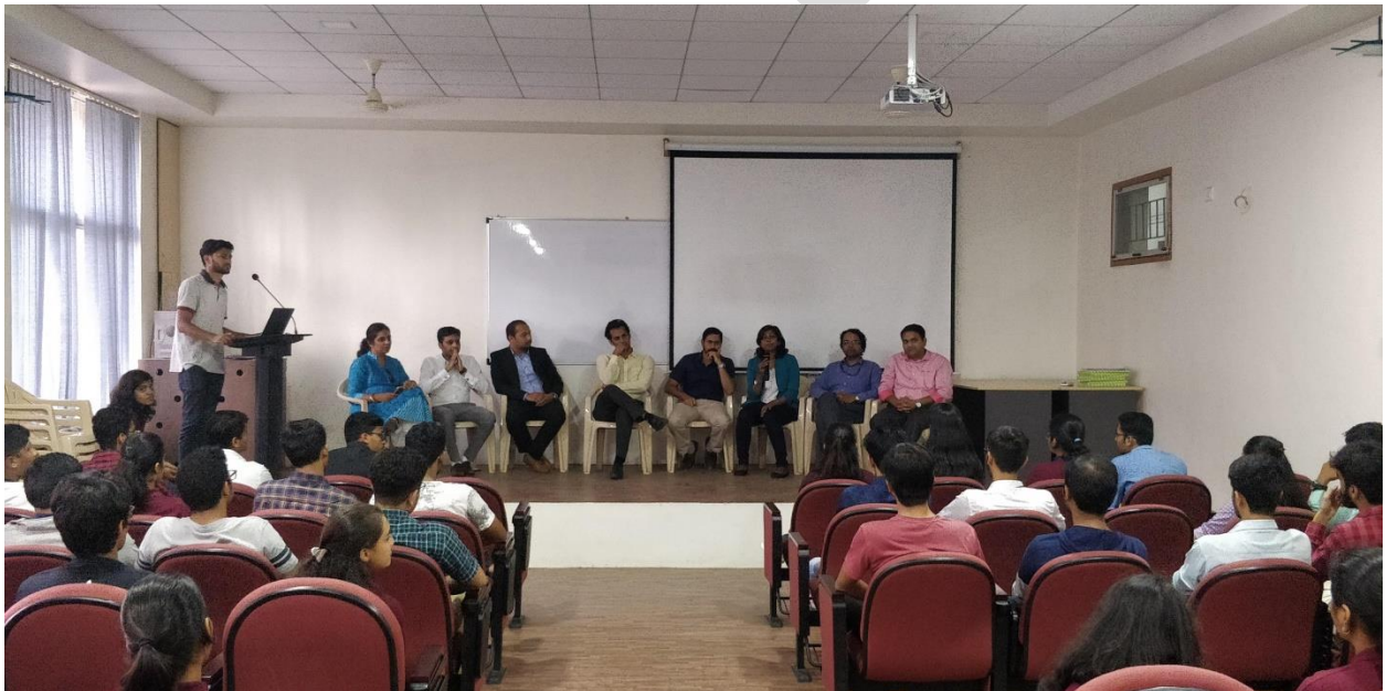
(In picture: Panel Discussion held at IT seminar hall)